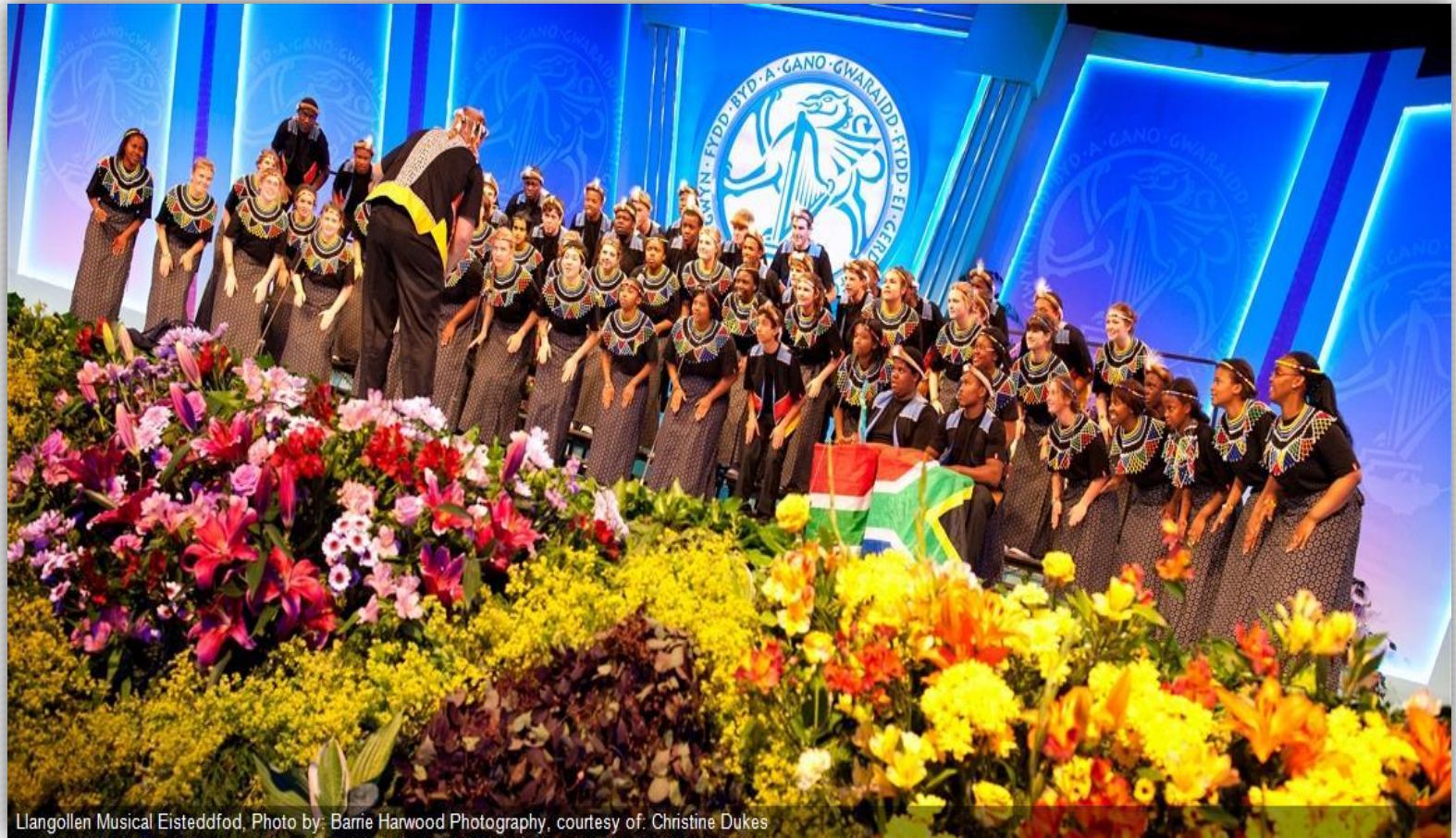
Llangollen Musical Eisteddfod, Photo by: Barrie Harwood Photography, courtesy of: Christine Dukes