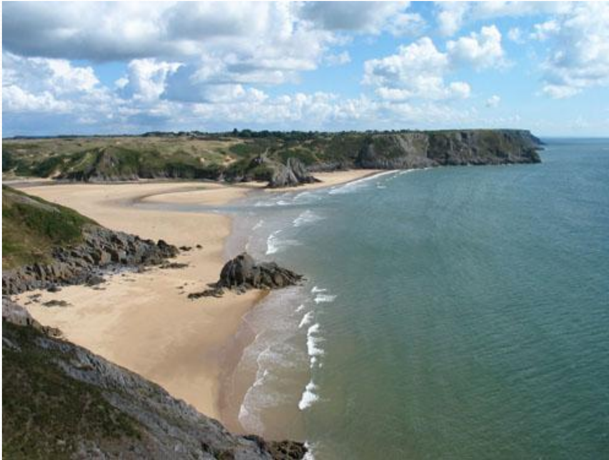
Tor Bay and Three Cliffs Bay , Swansea