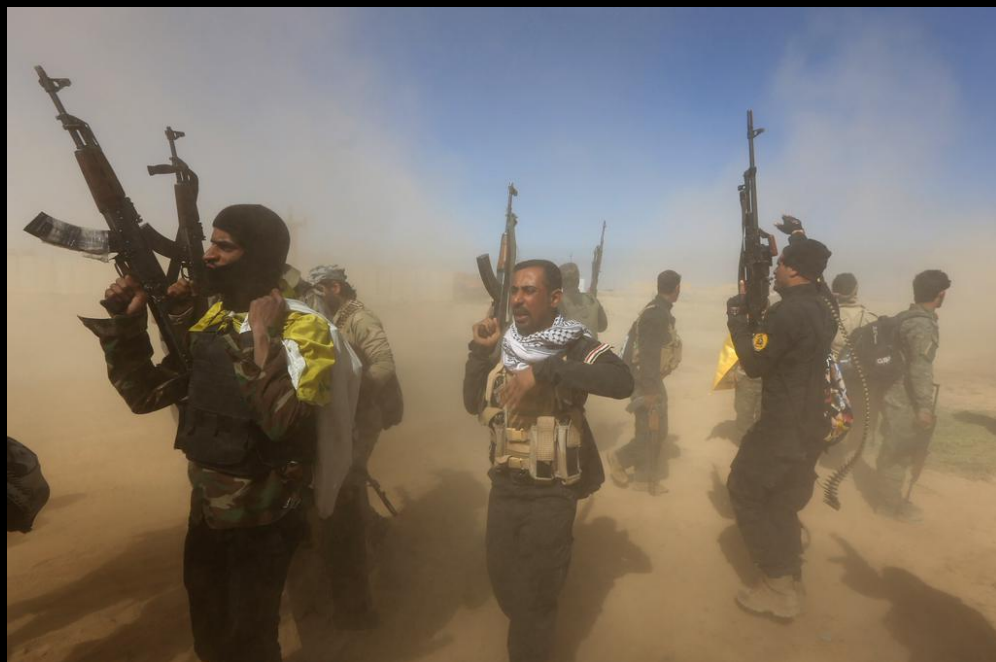
General Qasem Soleimani