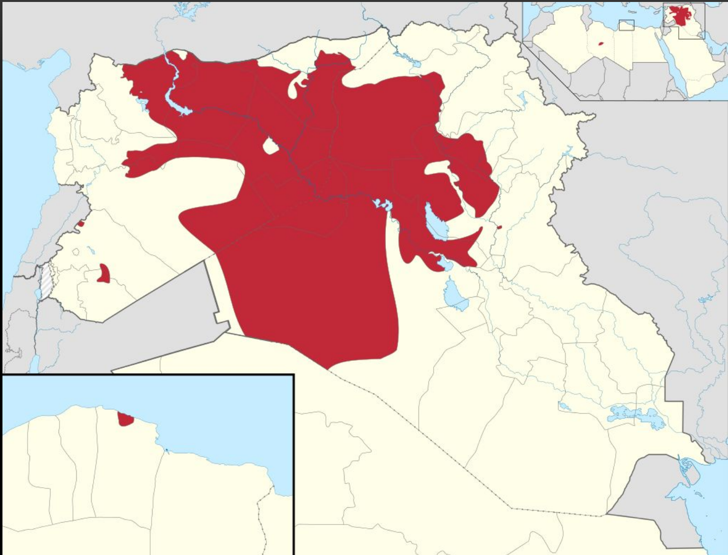
Area controlled by ISIS (3 February 2015)