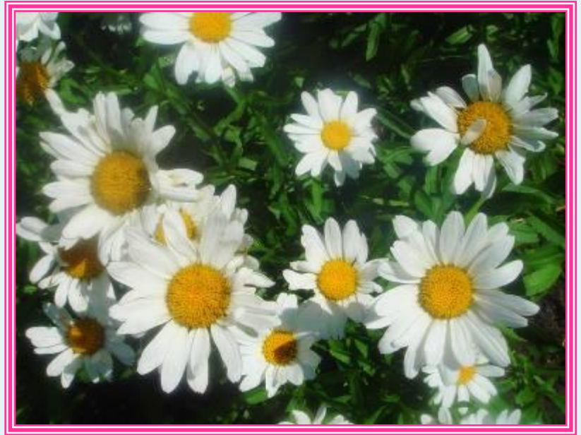
SUMMER IS BRIGHT