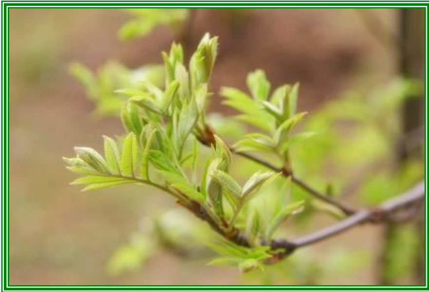
SPRING IS GREEN