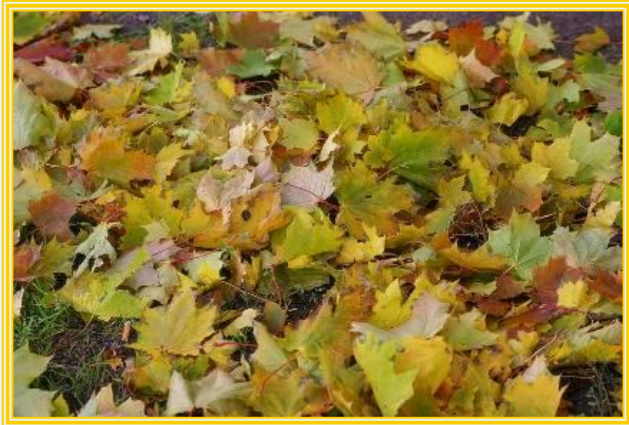
AUTUMN IS YELLOW