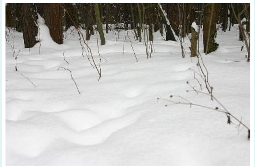
WINTER IS WHITE