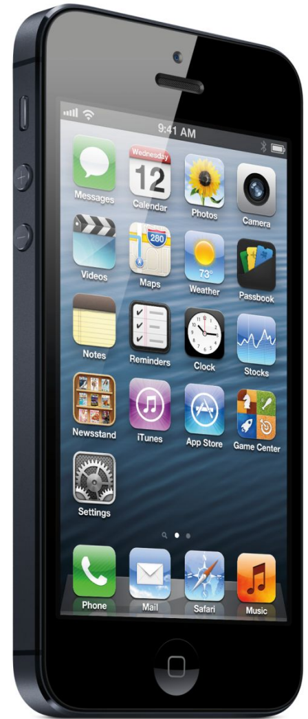
VIDEO MOBILE PHONE