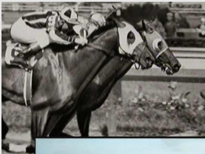
Photo left - photo realistic Admiral and Seabiscuit. A photo on the right and bottom - photos from the film, shot on real events. The film's title - «Seabiscuit». Rusk in red the form with a symbol of the letter «H».