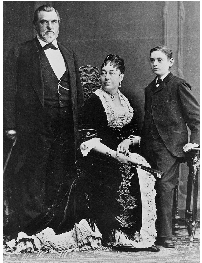
THE STANFORD FAMILY Leland, Jane and Leland Jr.

On October 1, 1891, Stanford University opened its doors after six years of planning and building. The first student body consisted of 555 men and women, and the original faculty of 15 was expanded to 49 for the second year. The university's first president was David Starr Jordan.