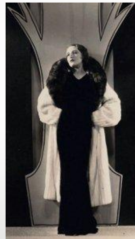
Bebe Daniels dressed in an evening gown