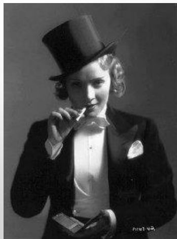
The "Boyish" Look