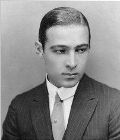
Rudolph Valentino Men's Fashion Icon

❖ 1920s fashion was the perfect blend between style and function. Beautiful clothes that allowed women to move.