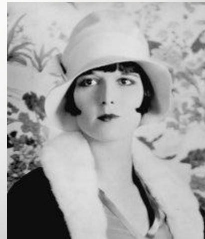
Beautiful Louise Brooks in a Cloche Hat