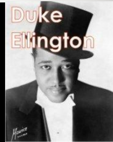
Leader of the Cotton Club - Duke Ellington