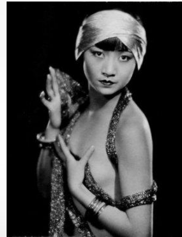
Anna May Wong

❖ From Lindbergh's "Spirit of Saint Louis", Ruth's 60 homeruns in 1927, to Fitzgerald's The Great Gatsby , the jazz age was a proverbial superstar's playground and a new and exciting world for the exploits of famous people in the 1920s.