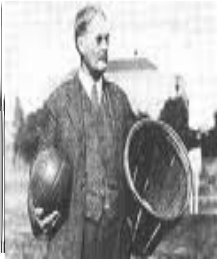
Dr. James Naismith