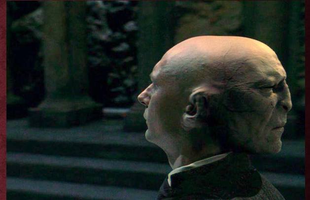
The man with two faces