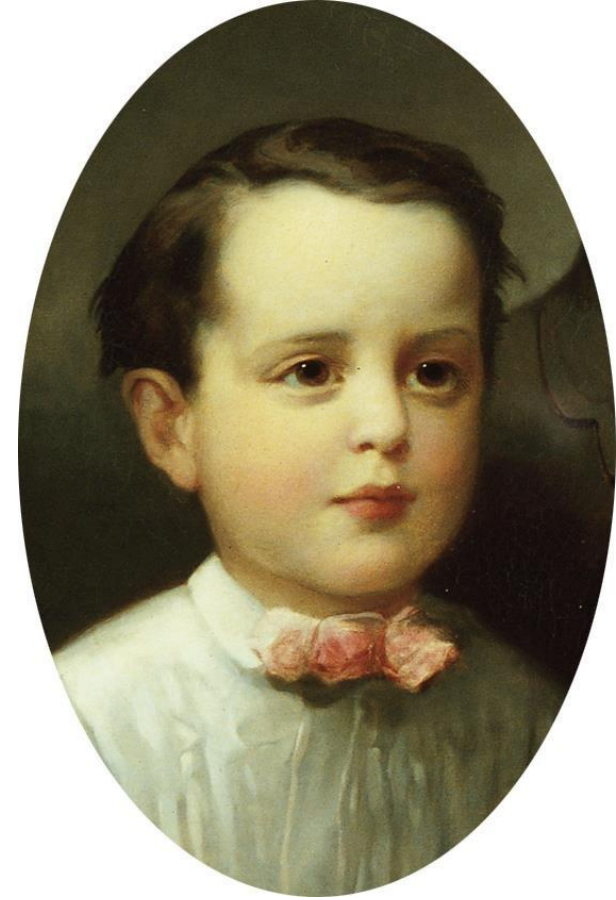
Childhood portrait of George Washington