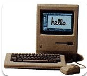
Macintosh Graphical User Interface