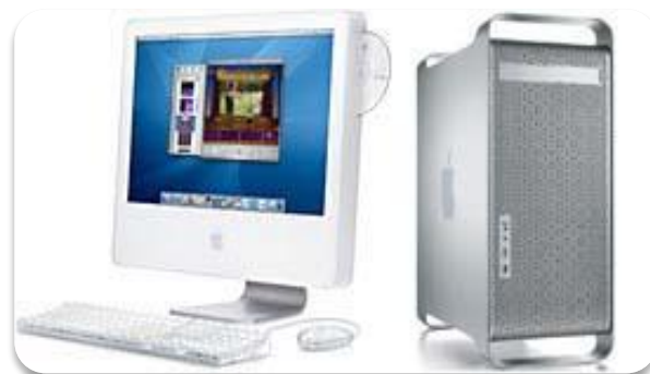
Power Mac G5