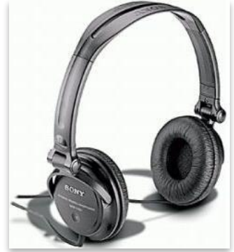
MIC + Headset