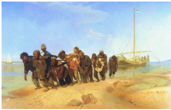
Barge Haulers on the Volga