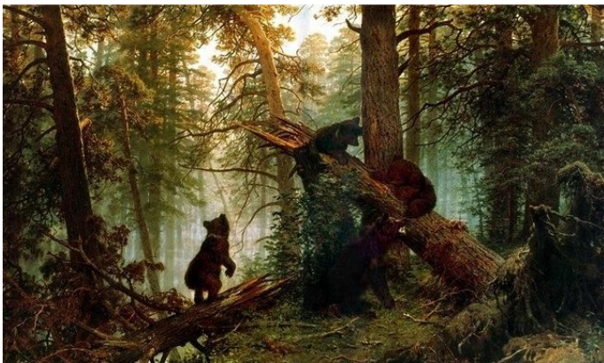
Morning in a Pine Forest