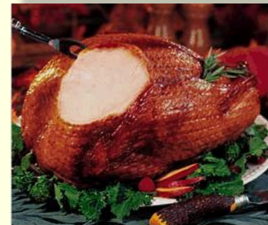
Hickory Smoked Turkey