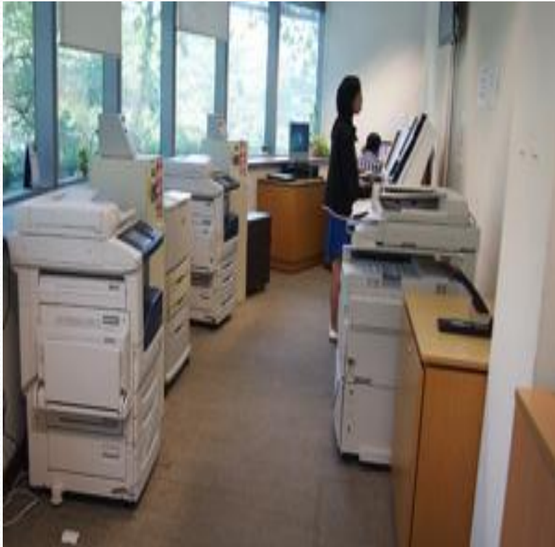
Li Ka Shing Library Printing Room on Level 2, 3, and 4

Use EZlink Card or CashCard for payment. Printing FAQ