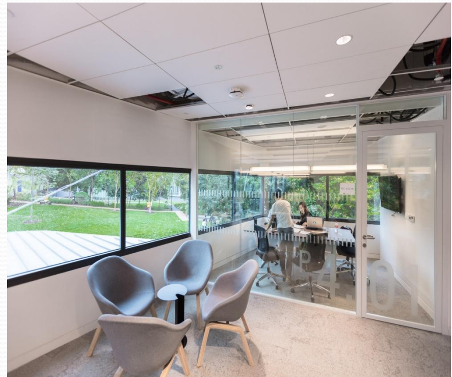
Kwa Geok Choo Law Library Level 4