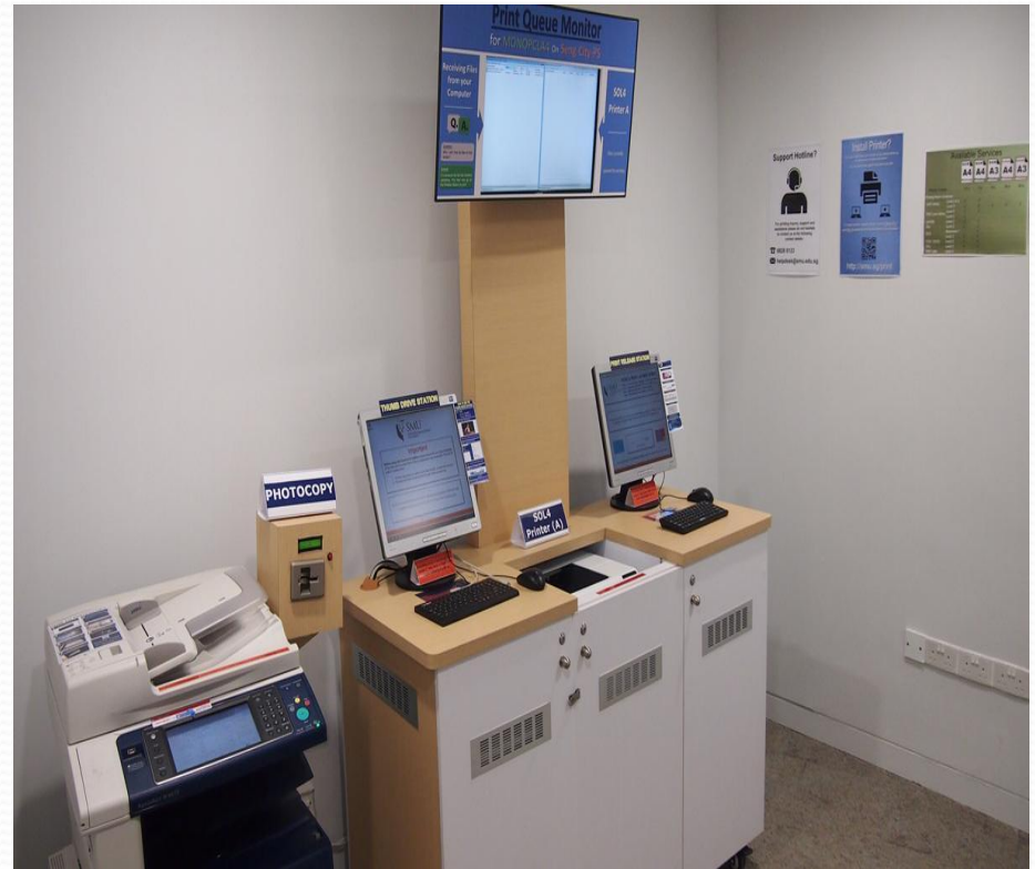
Kwa Geok Choo Law Library Printing Room on Level 4