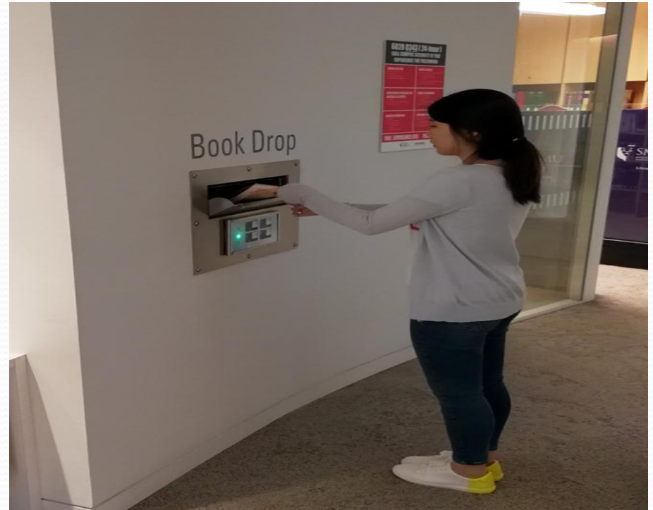
Kwa Geok Choo Law Library Level 3