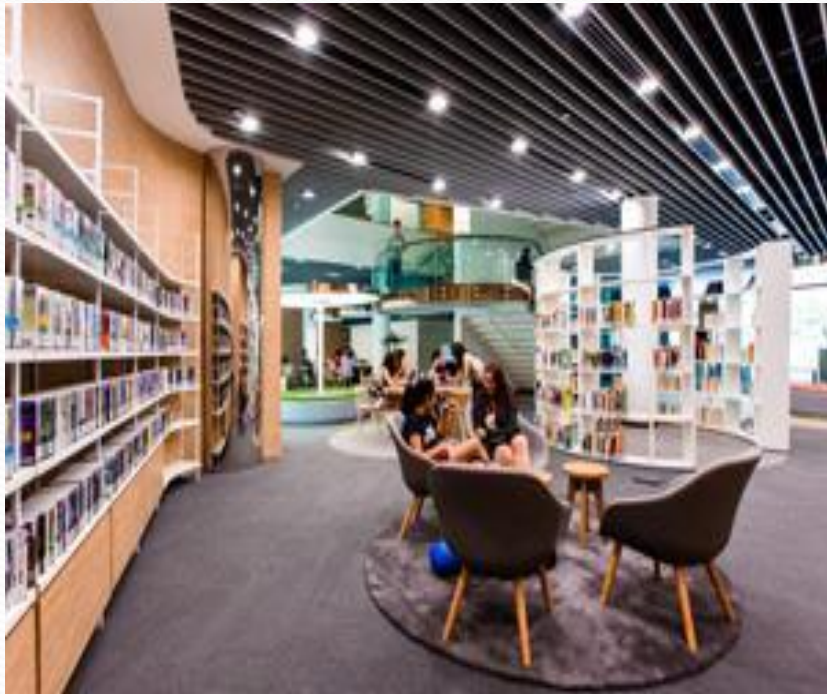
Li Ka Shing Library Level 2