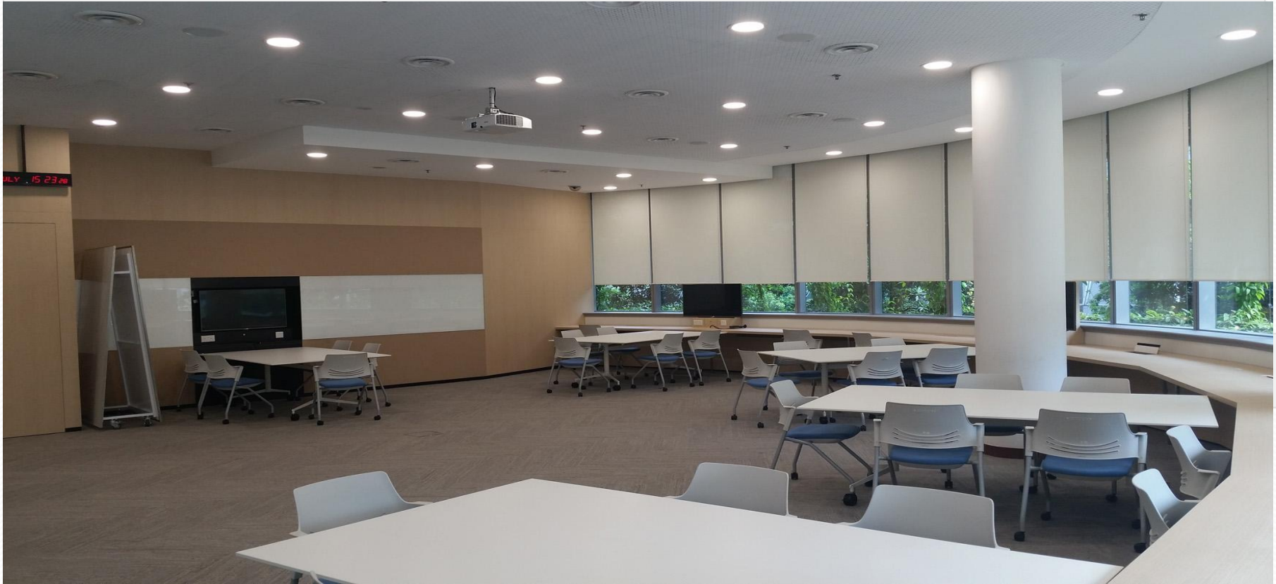
Li Ka Shing Library, Level 2

An extension of Learning Commons, Hive is equipped with flexible furniture and digital screens. This multipurpose area is designed for collaborative pedagogy.