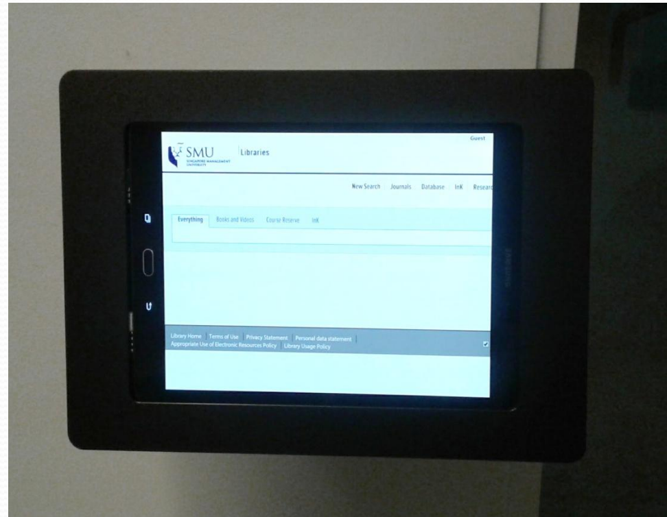
Kwa Geok Choo Law Library Level 3 and 4