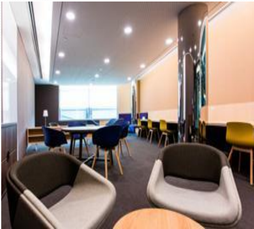
Li Ka Shing Library Level 5

A dedicated space for graduate students - for their study, research and discussion.