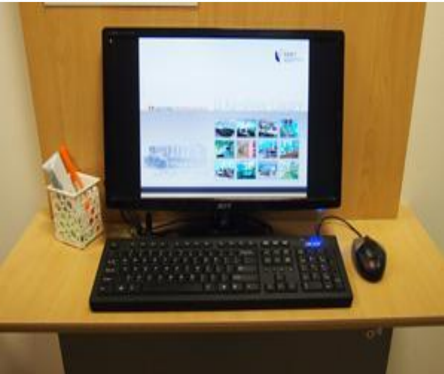
Li Ka Shing Library Level 2 and 3

Express Stations are “quick stop” stations to look up a book’s location.