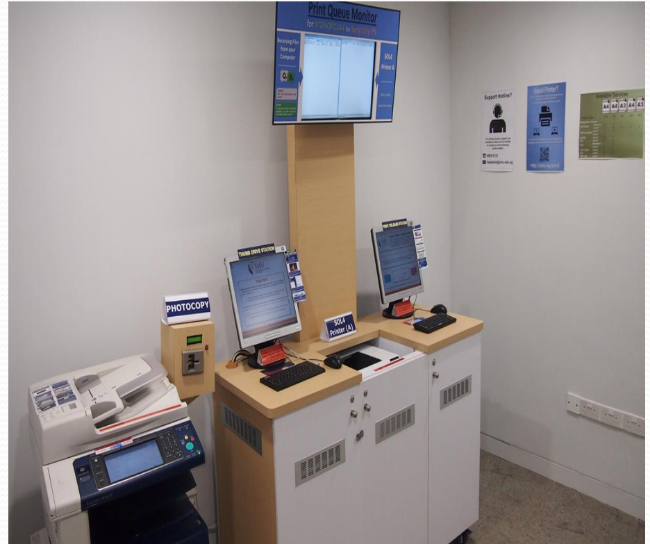
Kwa Geok Choo Law Library Printing Room on Level 4