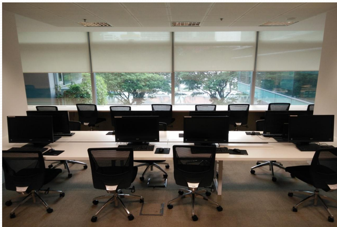
Li Ka Shing Library, Level 3