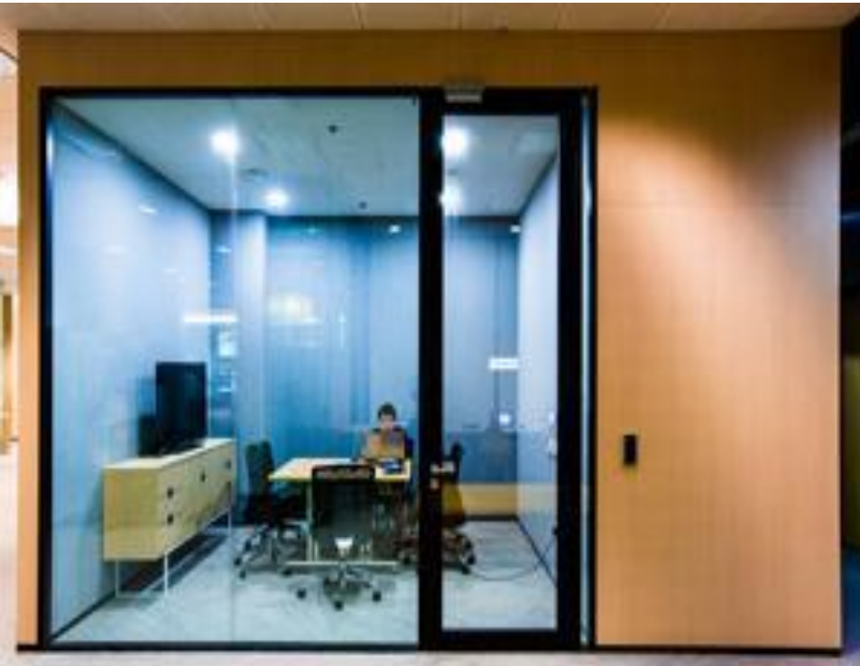
Li Ka Shing Library Level 2, 3, 4 and 5

Project rooms are ideal for group presentation and they can accommodate 4 to 8 persons. Advanced booking is required.