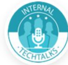
Internal Tech Talk Speaker