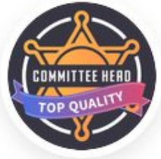
Top Assessment Committee He...

Please mention all important EPAM badges (from your point of view) with text comments to them.