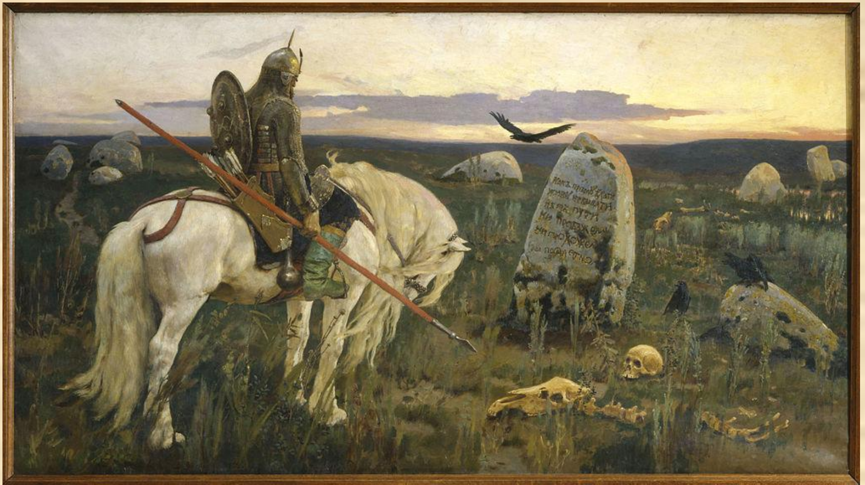
Victor Vasnetsov, Knight at the Crossroads (1882) «Витязь на распутье»