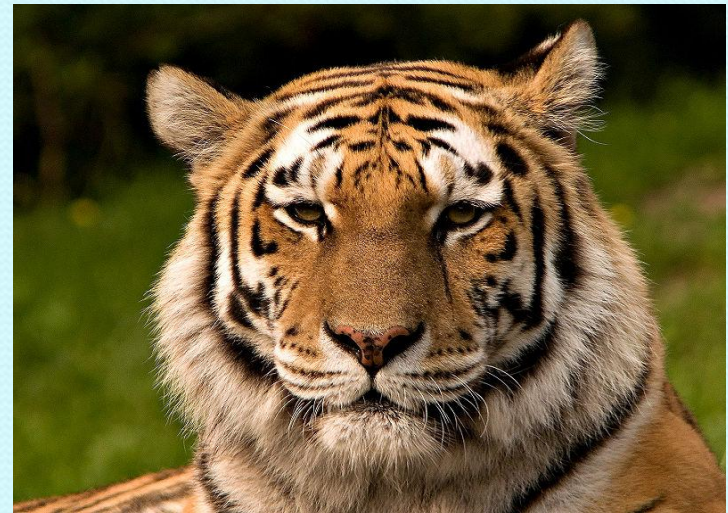
Siberian Tigers are on the verge of extinction.