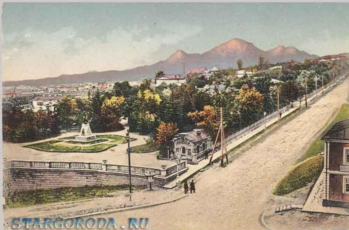
The public garden where a monument to Lermontov is situated.