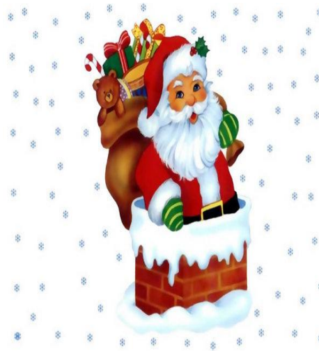
Father Christmas/Santa Claus