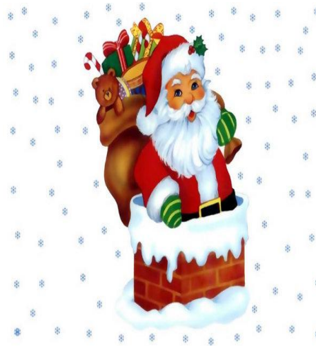
Father Christmas/Sant a Claus