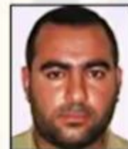
Abu Bakr al-Baghdadi