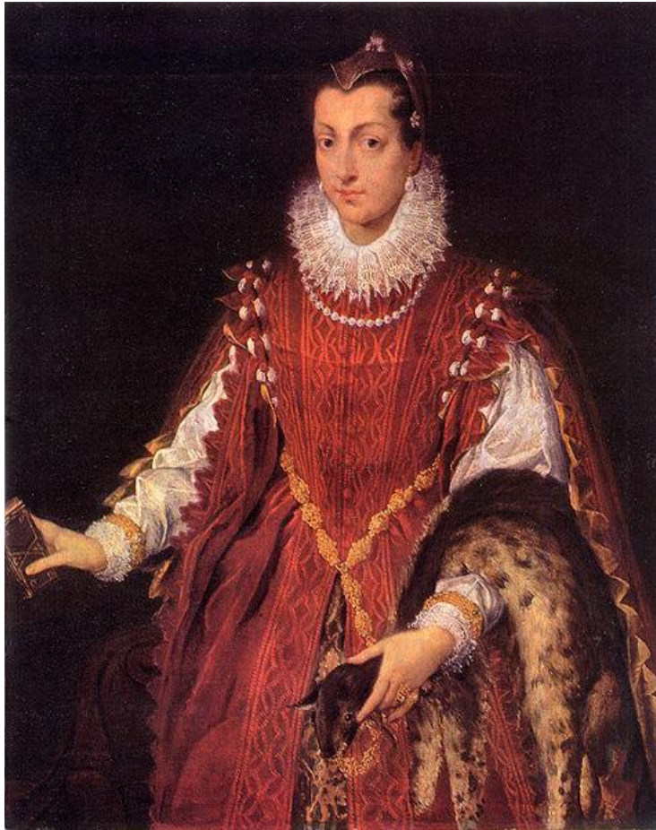
Sofonisba Anguissola. Portrait of a young patrician