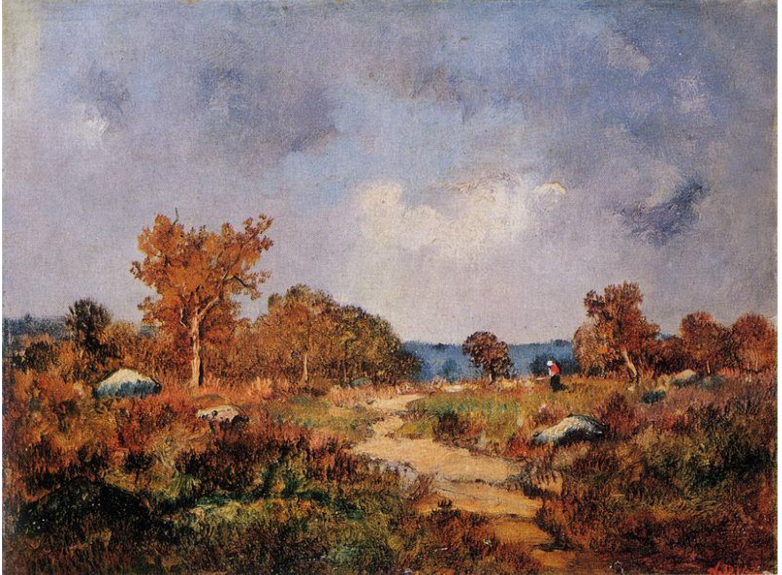
Narcisse Virgile Diaz de la Pena Autumn Landscape.