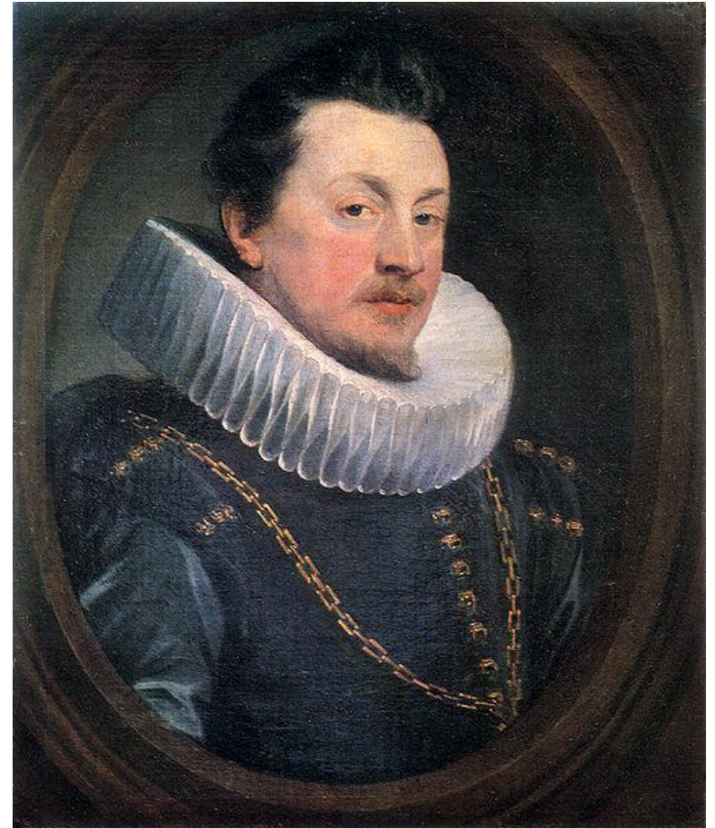
Peter Paul Rubens. Man Portrait