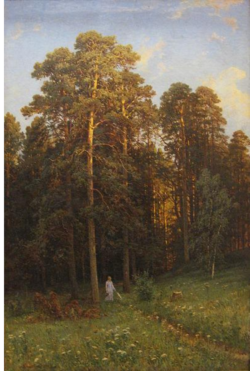
Ivan Shishkin At the edge of a pine forest

In 1940, after the city of Lviv/Lwów had been occupied by the Soviet Union, Soviet government ordered nationalization of private property. As a result, works from the Lubomirski family museum, the Baworowscy Library, and some other private collections came into the possession of the gallery.