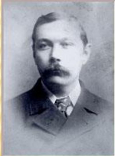
Arthur Conan Doyle as a young doctor