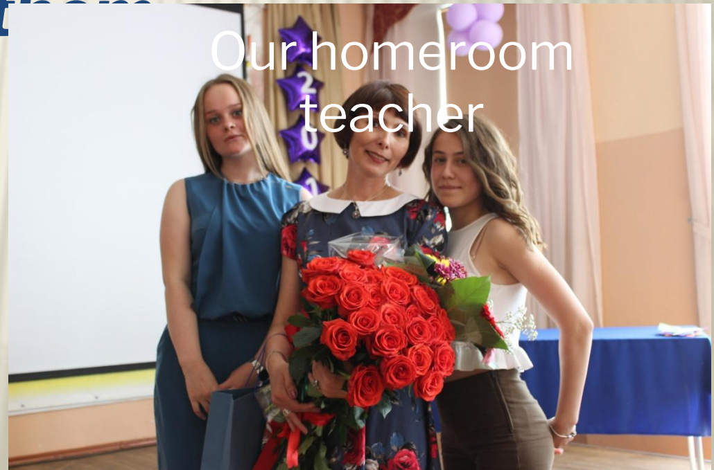
Our homeroom teacher

▣ I think that people should have a few friends. If they make friends they will never feel lonely. In my opinion, good friends to help you when you have problems. In addition, you will never get bored with them.