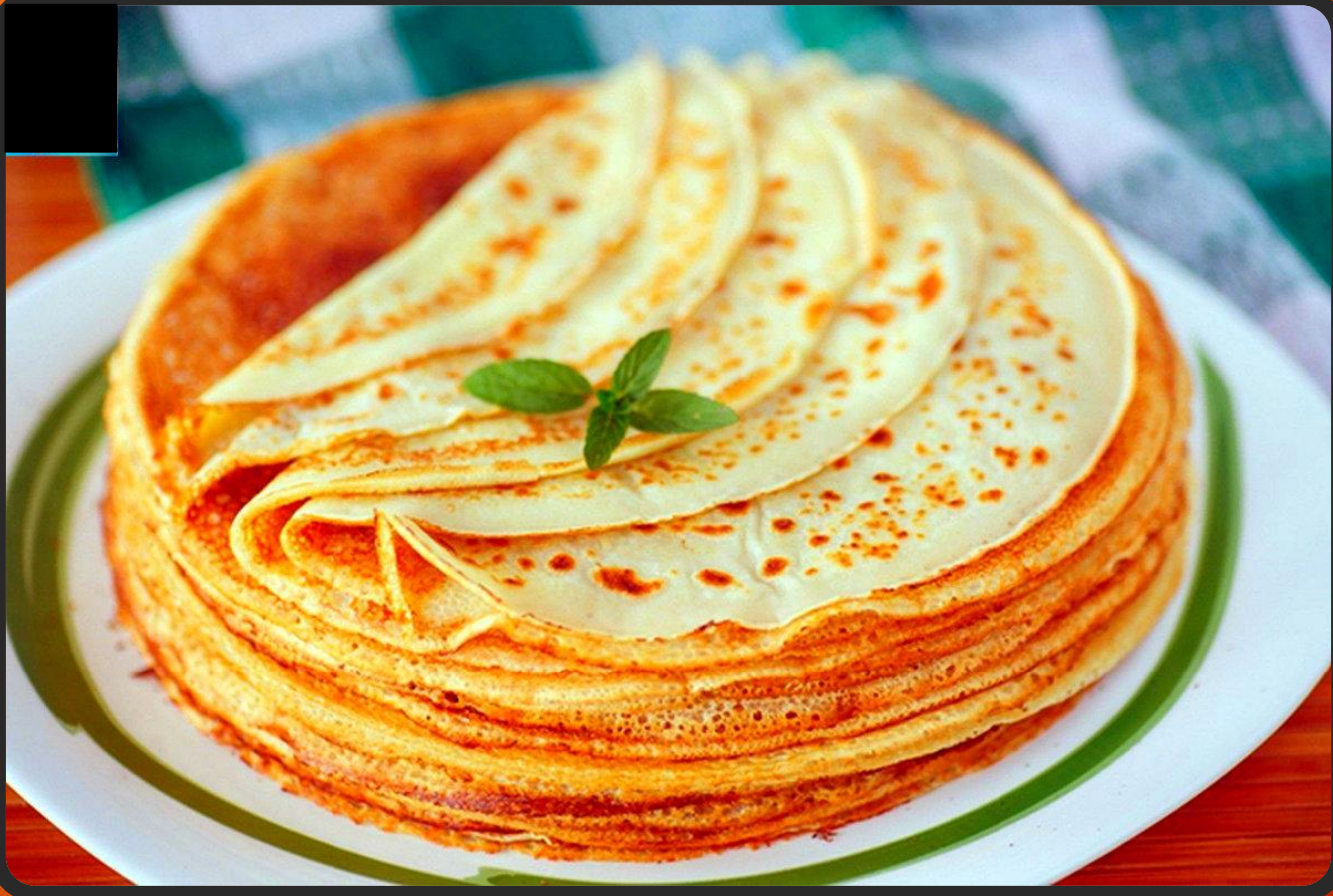
Photo of blini