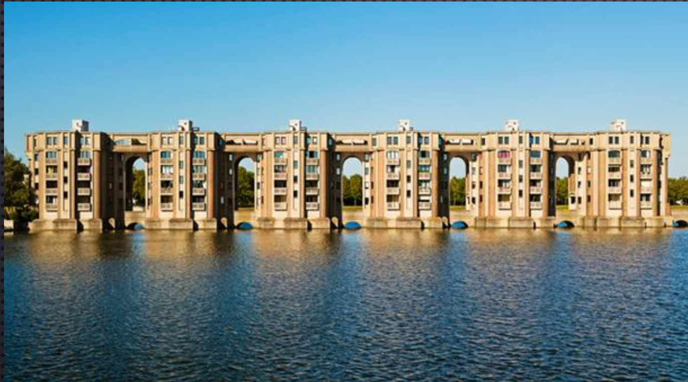
THE FIRST PROJECT OF SOCIAL HOUSING IN FRANCE, 1982.

RICARDO BOFILL HAS CREATED OVER 1000 PROJECTS THROUGHOUT HIS CAREER. BOFILL'S STYLE EVOLVED WITH HIM. AT SOME POINT, THE ARCHITECT TURNED TO HIGH-SPEED SKYSCRAPERS IN THE UNITED STATES, A LUXURY GLASS HOTEL-SAIL W IN BARCELONA OR, FOR EXAMPLE, EL PRATT AIRPORT. BOFILL ALSO CREATED SEVERAL PROJECTS IN RUSSIA, AND SOME OF THEM HAVE ALREADY BEEN IMPLEMENTED.