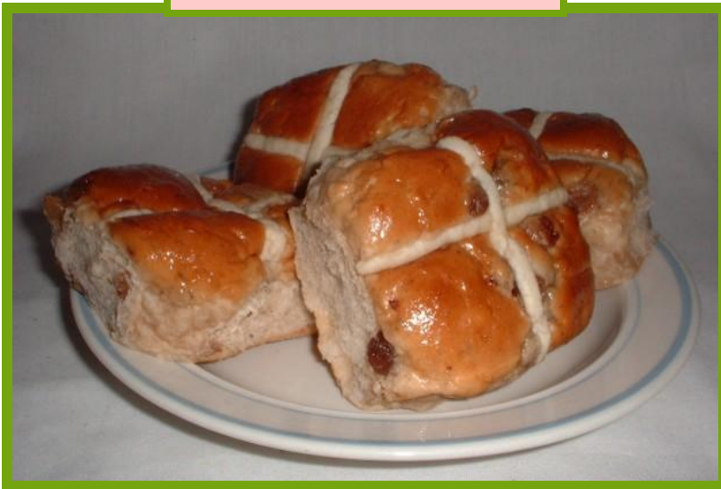
Hot cross buns