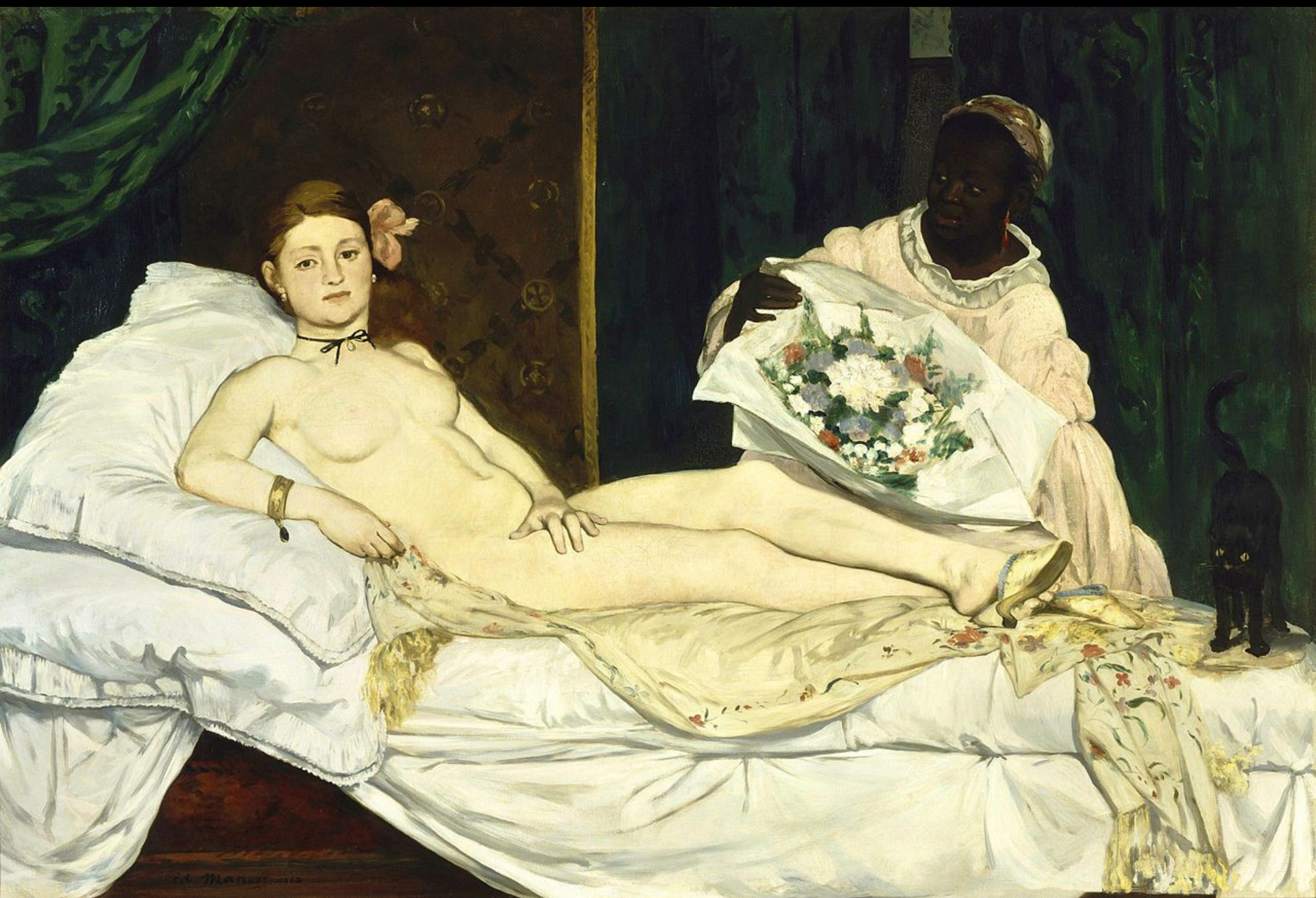
Edouard Manet, Olympia , 1863