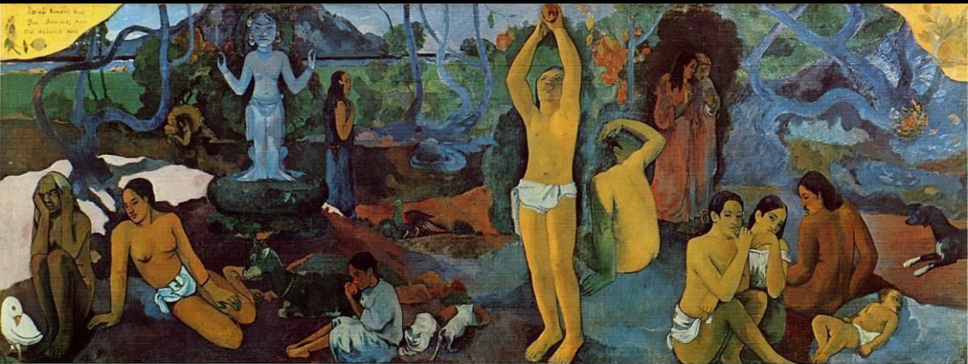
Gauguin, Where Do We Come From? What Are We? Where Are We Going? 1897