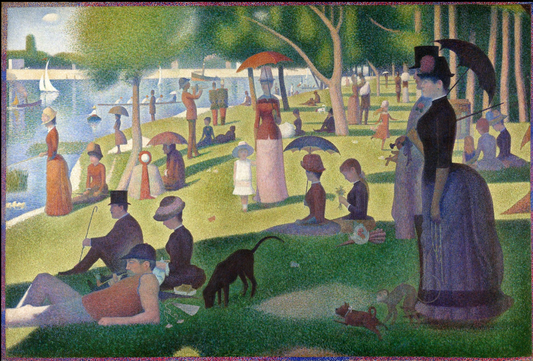
George Seurat, Sunday Afternoon on the Island of La Grande Jatte, 1884-86