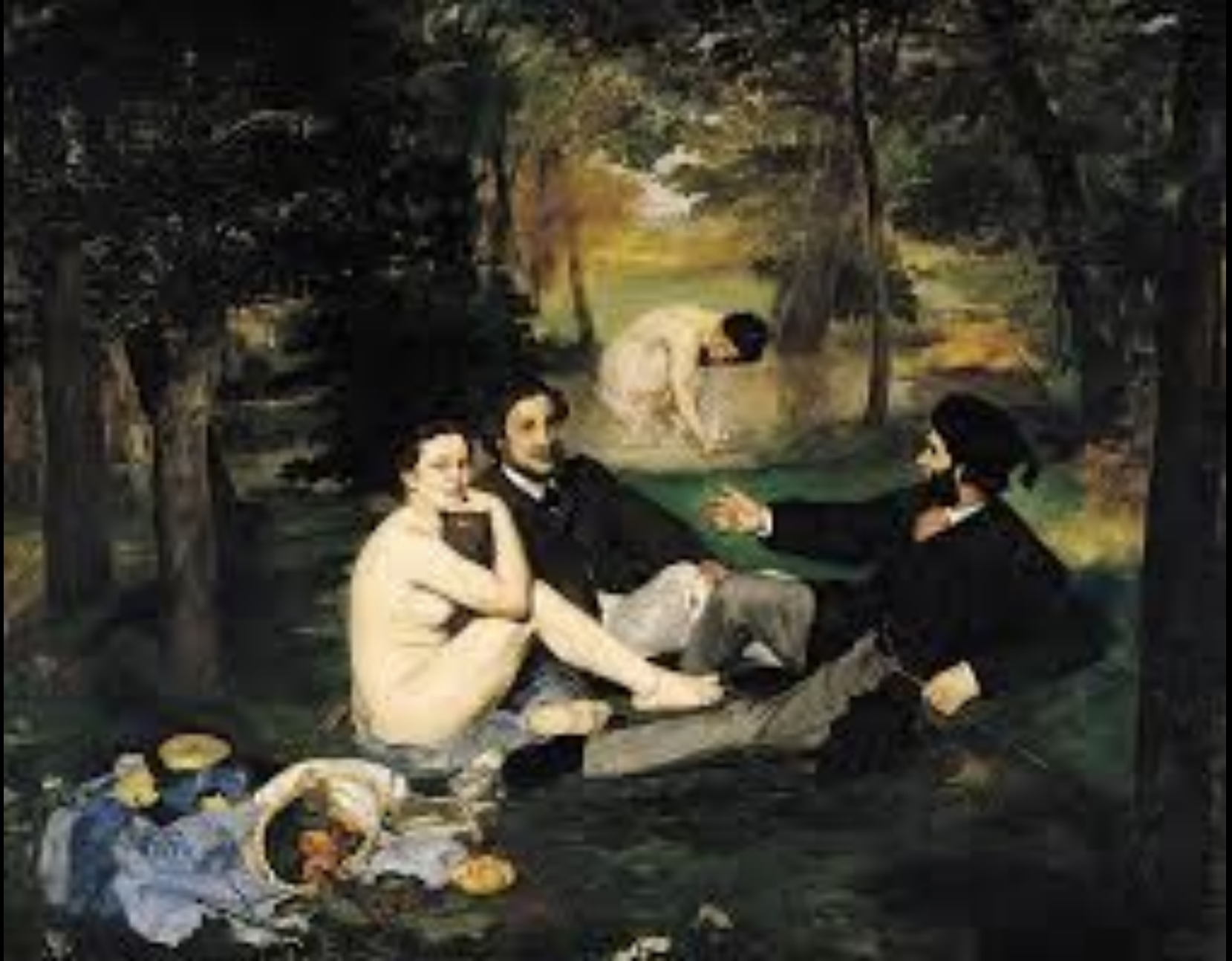
Manet, Luncheon on the Grass , 1863