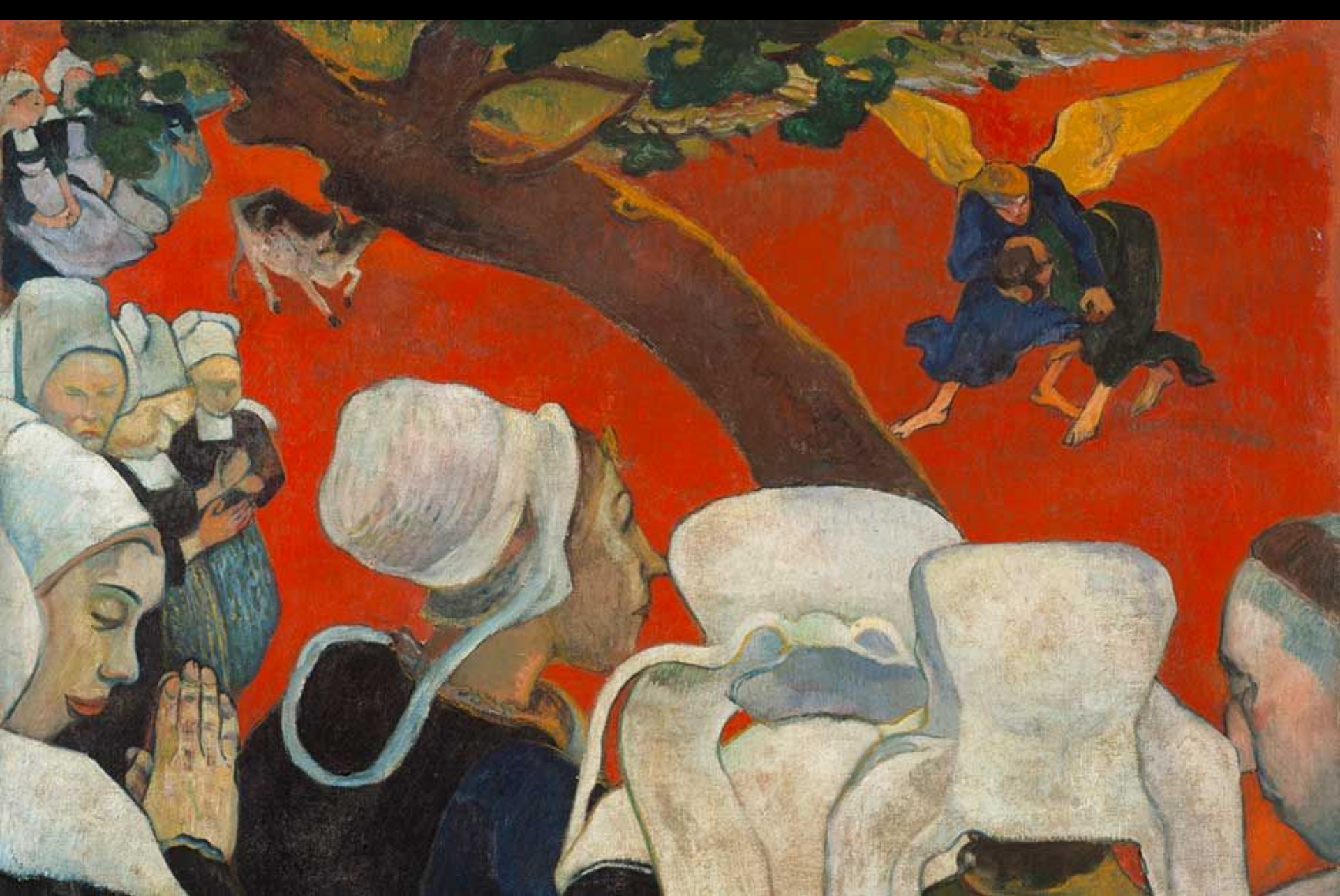
Gauguin, Vision After the Sermon (Jacob Wrestling with the Angel), 1888