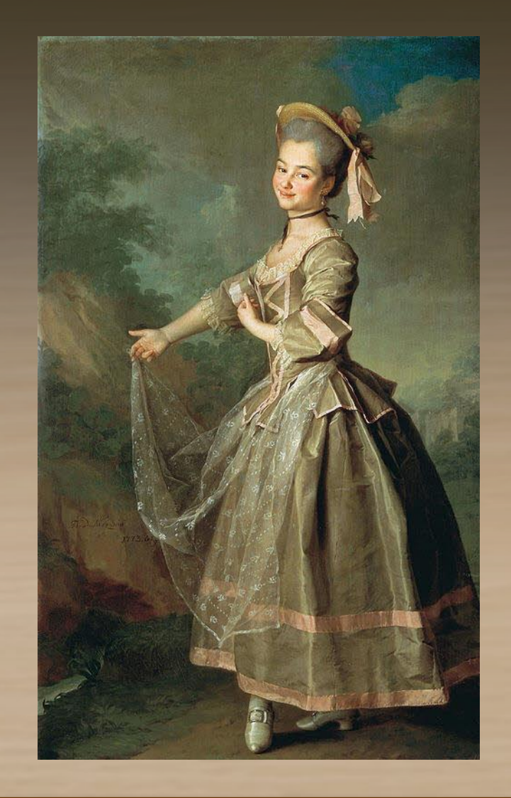
Ekaterina Nelidova, 1773