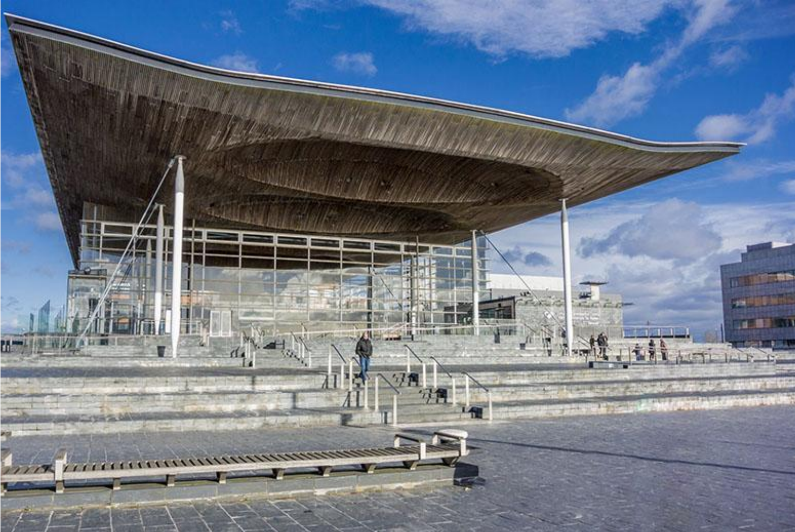
The Senedd (National Assembly building)