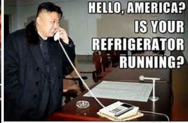
HELLO, AMERICA? IS YOUR REFRIGERATOR RUNNING?