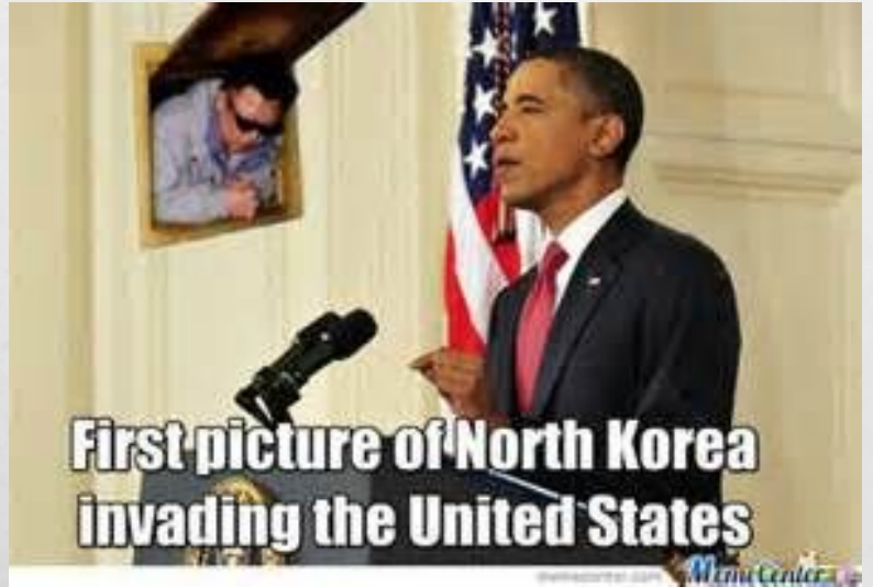
First picture of North Korea invading the United States