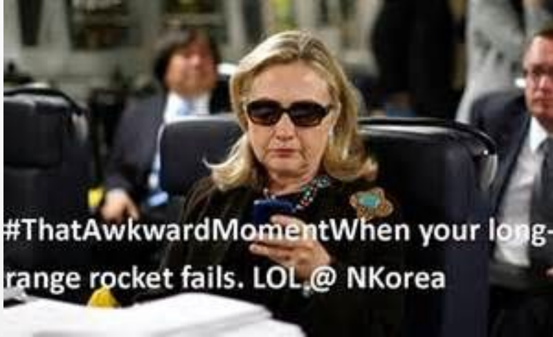
#ThatAwkwardMomentWhen your long-range rocket fails. LOL @ NKorea