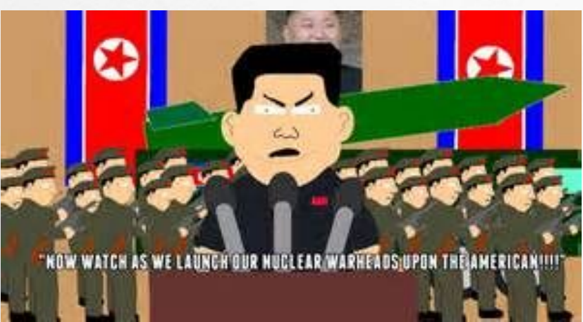
"NOW WATCH AS WE LAUNCH OUR NUCLEAR WARHEADS UPON THE AMERICAN!!!!"