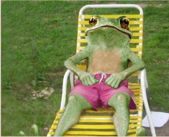
A frog can...