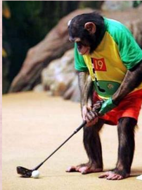
A chimp can...