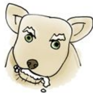
The Mad Dog

The mob, injustice, anything Atticus has to fight