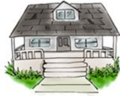
The Radley Place