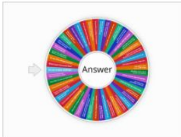
Matura conversation 2 Koło fortuny wg Mikelp1981

Liczba wyników dla zapytania 'matura speaking questions': 10000+