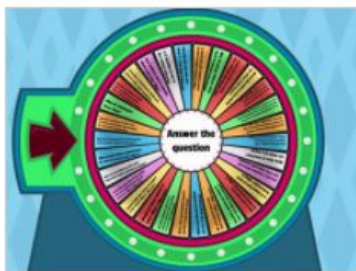
Speaking warm-up (matura) Koło fortuny wg Nicca

https://wordwall.net/pl-pl/community/matura-speaking-questions