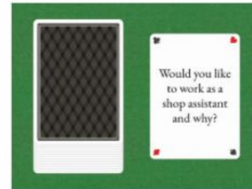
MATURA WORKSHOPS - SPEAKING (BASIC) Losowe karty wg Magdalena138