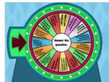
MATURA SPEAKING - TASK 0 Koło fortuny wg Anetabudka