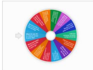
MATURA WORKSHOPS SPEAKING (EXTENDED) Koło fortuny wg Magdalena138

Klasa 8 Gimnazjum Dorośli Liceum Angielski Indirect Questions Matura