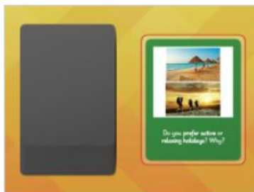
Speaking Holiday Travelling FCE Matura - questions. Losowe karty wg Face2face