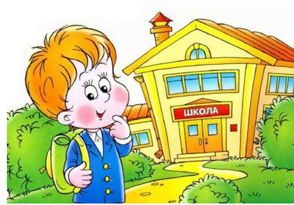
go to school