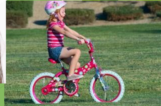
ride a bike