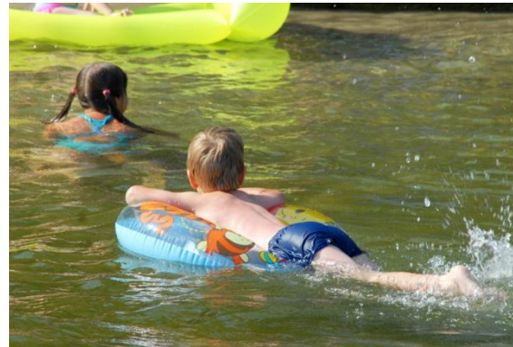
swim in the river