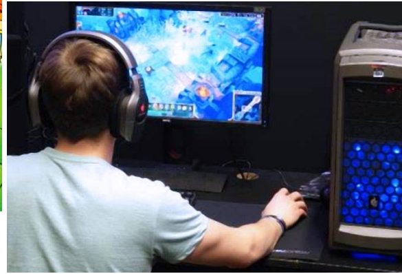
play computer games