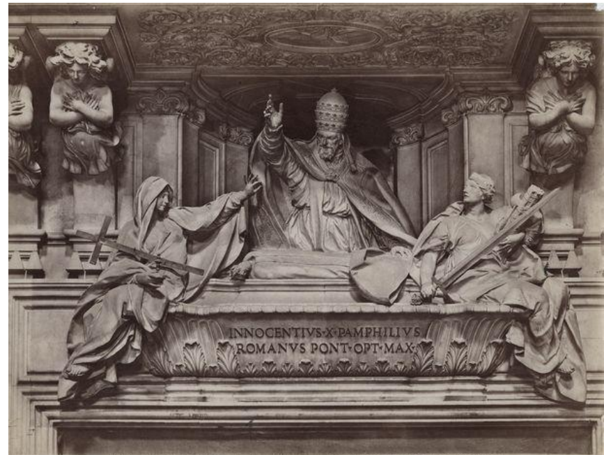
N.° 30013. ROMA - Chiesa di S. Agnese in Piazza Navona. Monumento a Papa Innocent X Pamphilii. (G. Batt. Maini).