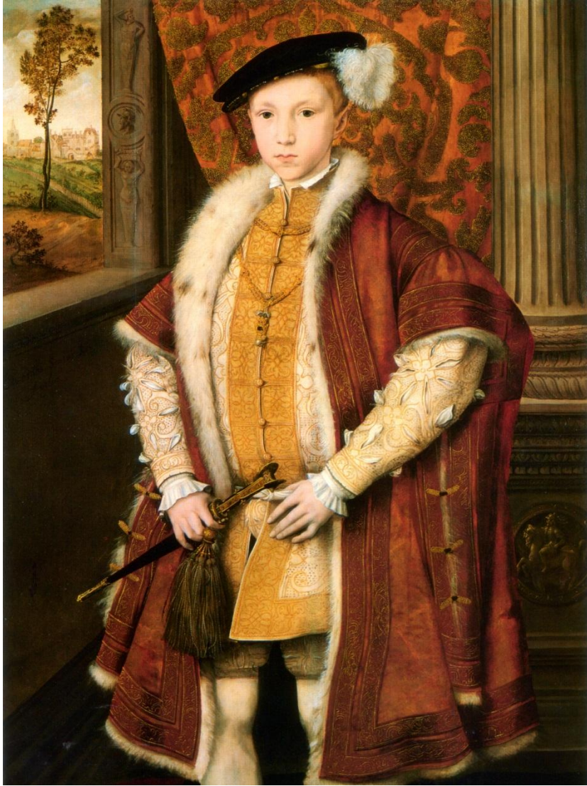
Edward VI of England