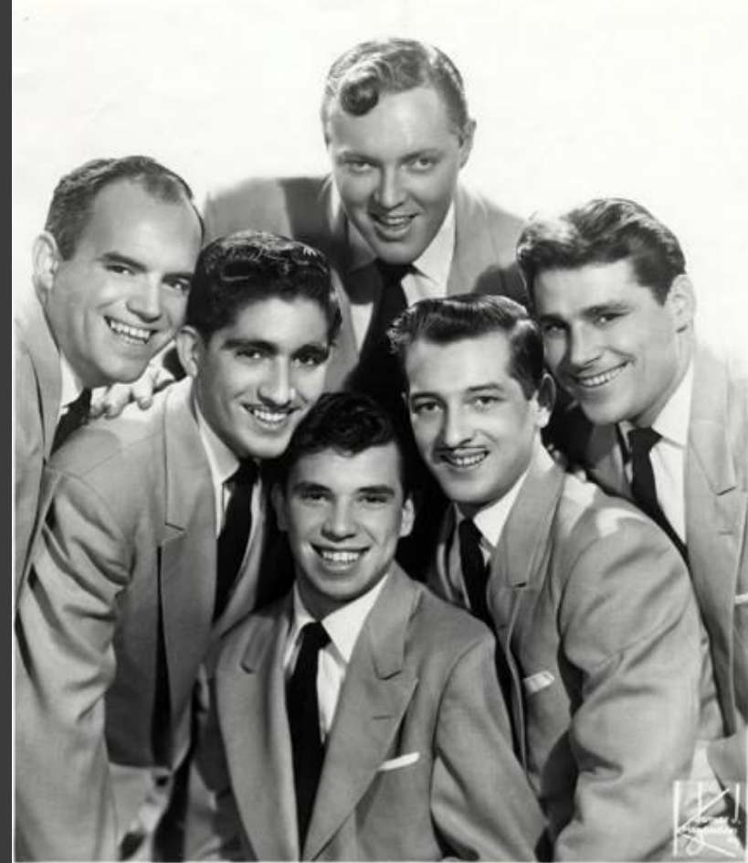
Bill Haley & His Comets