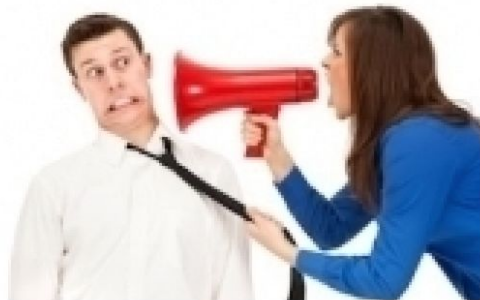
What the media thinks I do