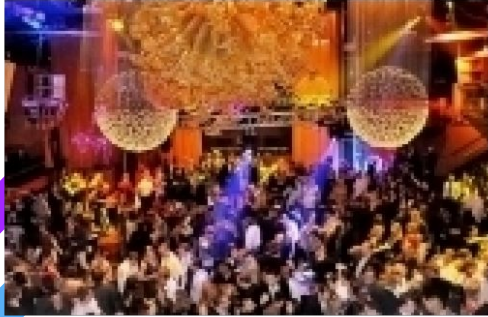
What my friends thinks I do