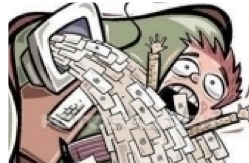
What I actually do