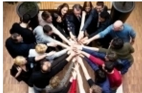
What I thinks I do