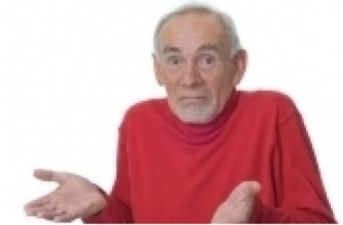
What my parents thinks I do