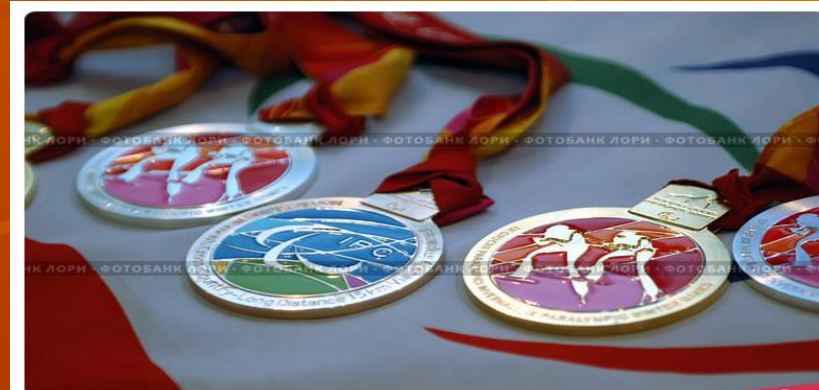
Медали разного достоинства Девятых зимних Паралимпийских игр в Турине 2006