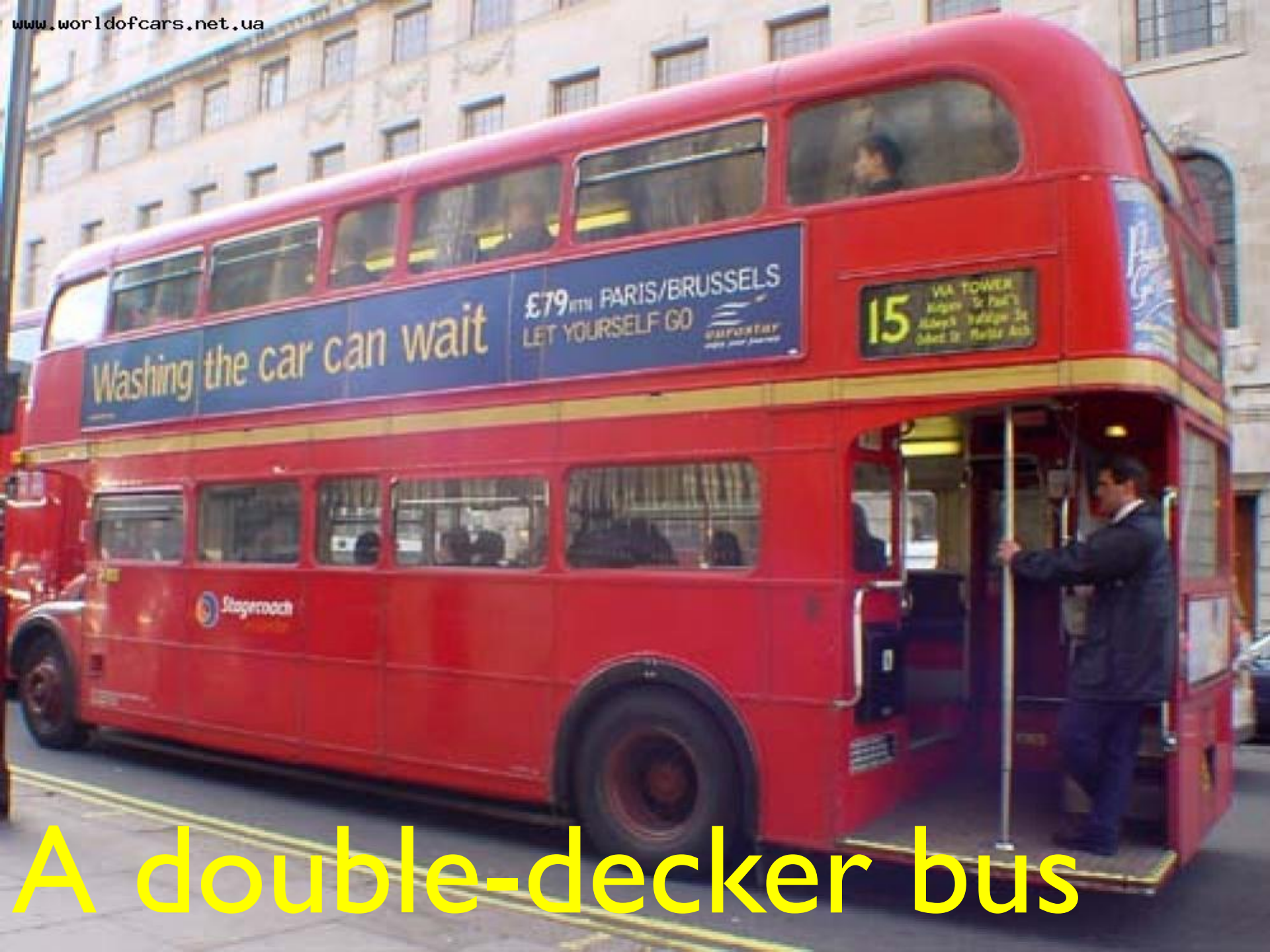
A double-decker bus