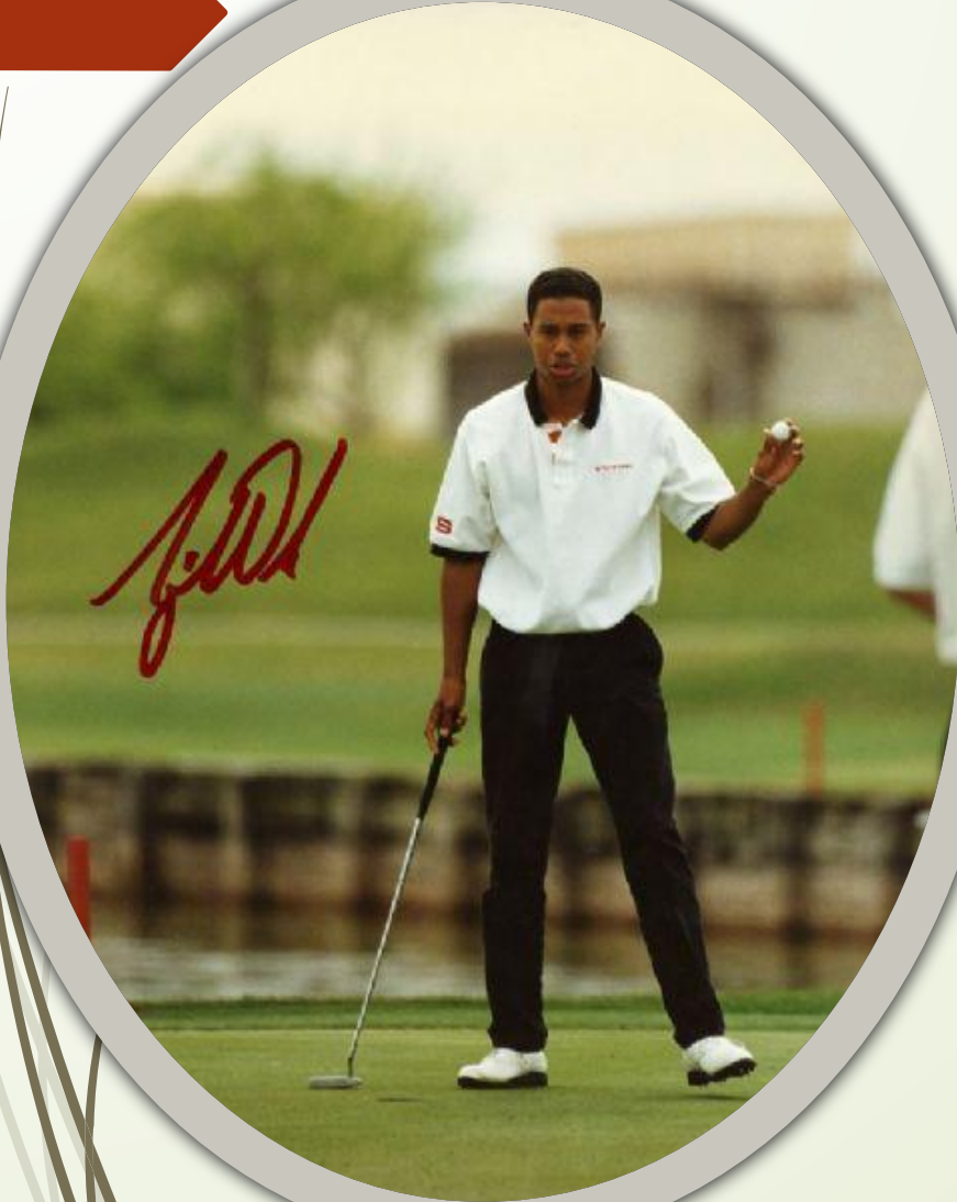
Tiger Woods – golf player