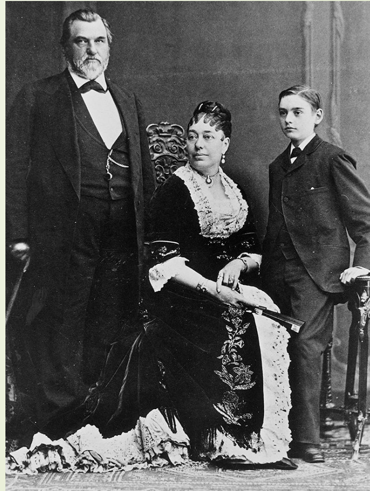
THE STANFORD FAMILY

On October 1, 1891, Stanford University opened its doors after six years of planning and building. The first student body consisted of 555 men and women, and the original faculty of 15 was expanded to 49 for the second year. The university's first president was David Starr Jordan.