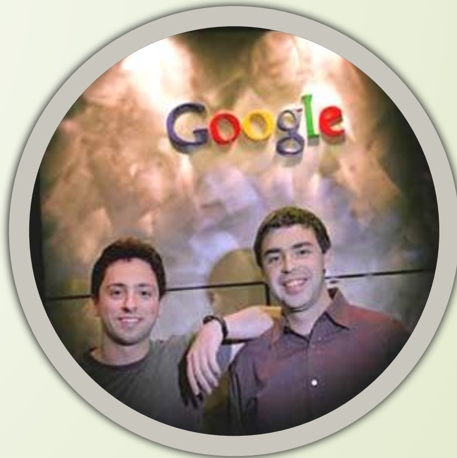
Sergei Brin and Laurence Page - Founders of Google