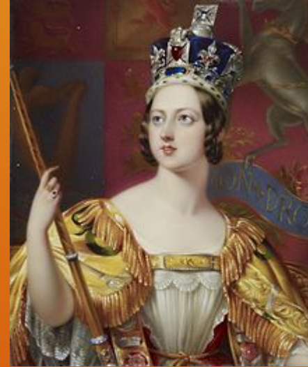
▣ Coronation portrait of George Hayter (brush).

Victorian fashion Collection of fashion trends in clothing and accessories specific to the United Kingdom during the reign of Queen Victoria (1837-1901).