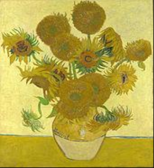
Vase with Fourteen Sunflowers