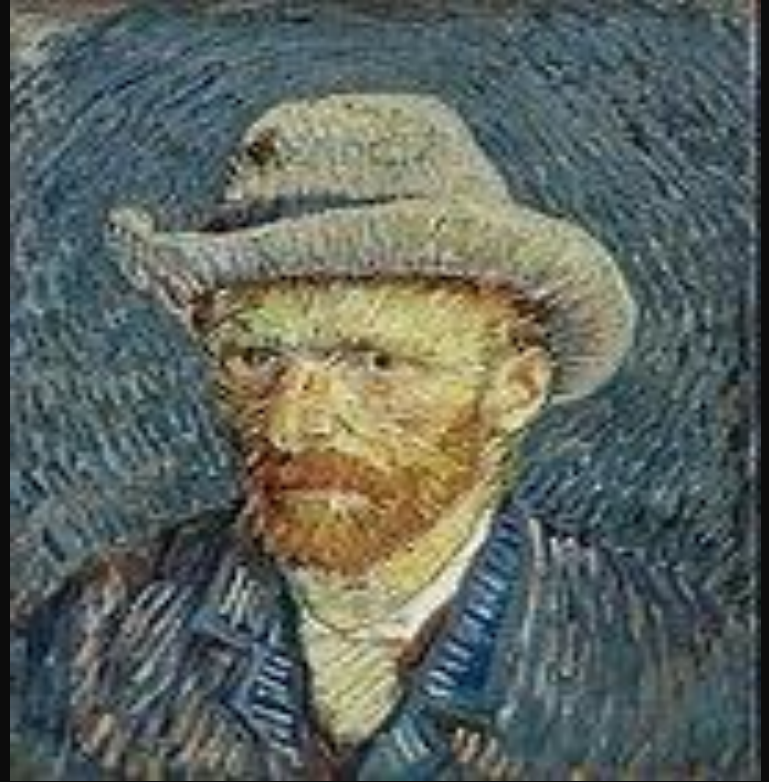
Self-Portrait with Grey Felt Hat, Winter 1887-88.