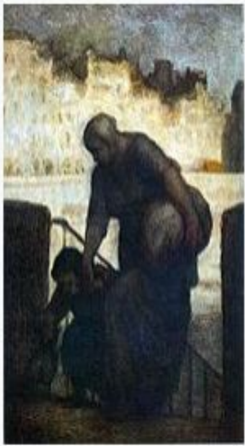
Honoré Daumier, Laundress on the Quai d'Anjou , c. 1860