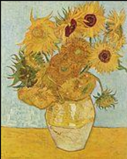
Vase with Twelve Sunflowers