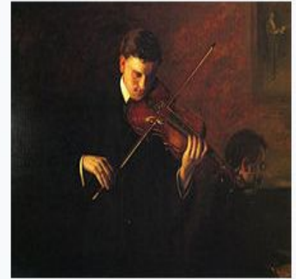
Thomas Eakins, Music , 1904