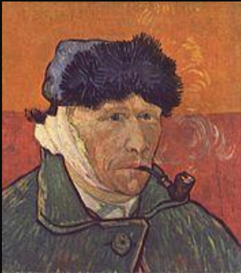
Self-portrait with Bandaged Ear and Pipe, 1889