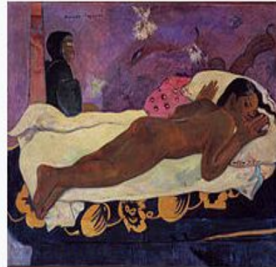
Paul Gauguin, Spirit of the Dead Watching 1892