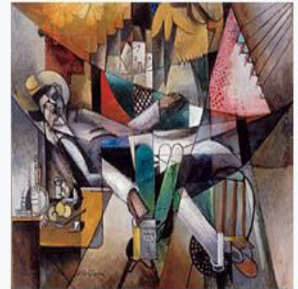
Albert Gleizes, L'Homme au Hamac (Man in a Hammock) , 1913, oil on canvas, 130 x 155.5 cm