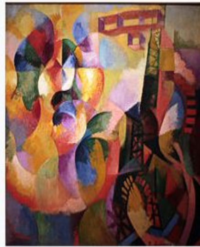
Robert Delaunay, Soleil, Tour, Aéroplane (Sun, Tower, Airplane) , 1913