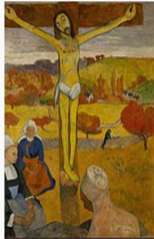
Paul Gauguin, The Yellow Christ , 1889