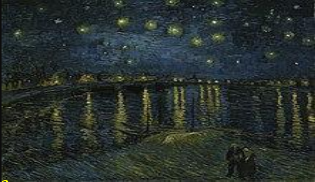
Starry Night Over the Rhone