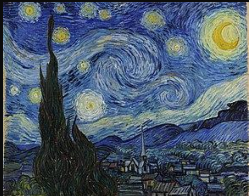
The Starry Night