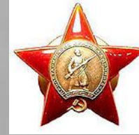
Order Of The Red Star Орден "Красная Звезда"