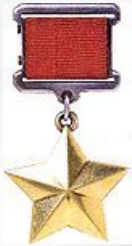
Medal "Golden Star" of The Hero of the Soviet Union Медаль "Золотая звезда"