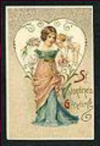
Valentine postcard, circa 1900-1910

"Pop-ups" create a three-dimensional effect when opened, circa 1900