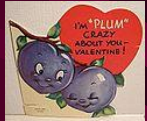
Anthropomorphic Valentine, circa 1950-1960