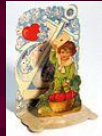
A tiny 2-inch pop-up Valentine, circa 1920