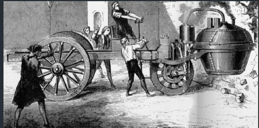
Это модель первого паромобиля Кюньо 1769 года.