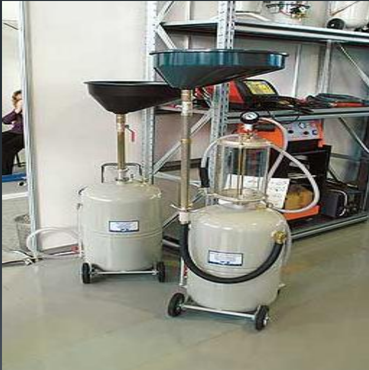
The blower motor OILS