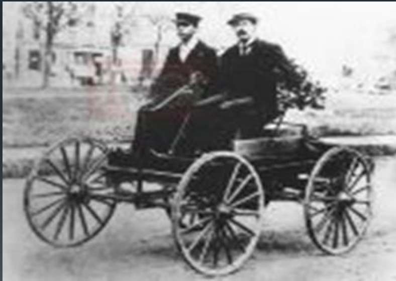
The first car made in Detroit, 1896

The very first runaway strollers appeared in the 18th century in different countries of the world. For a long time they were modified and improved. But, like any mechanism, they are required to maintain and repair in case of breakage. This could be done only by people who are well versed in the inner workings of the car. So there is a new profession mechanic.