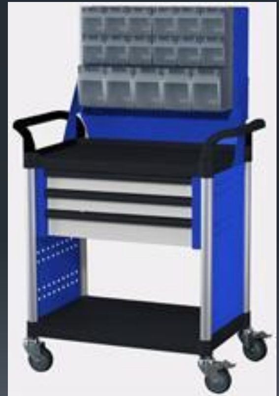
The closet instrumental