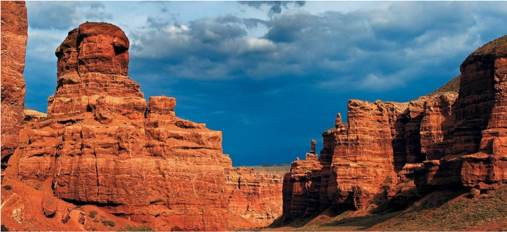
Terrain Charyn Canyon

The terrain of Kazakhstan includes flatlands, steppe, taiga, rock canyons, hills, deltas, snow-capped mountains, and deserts.