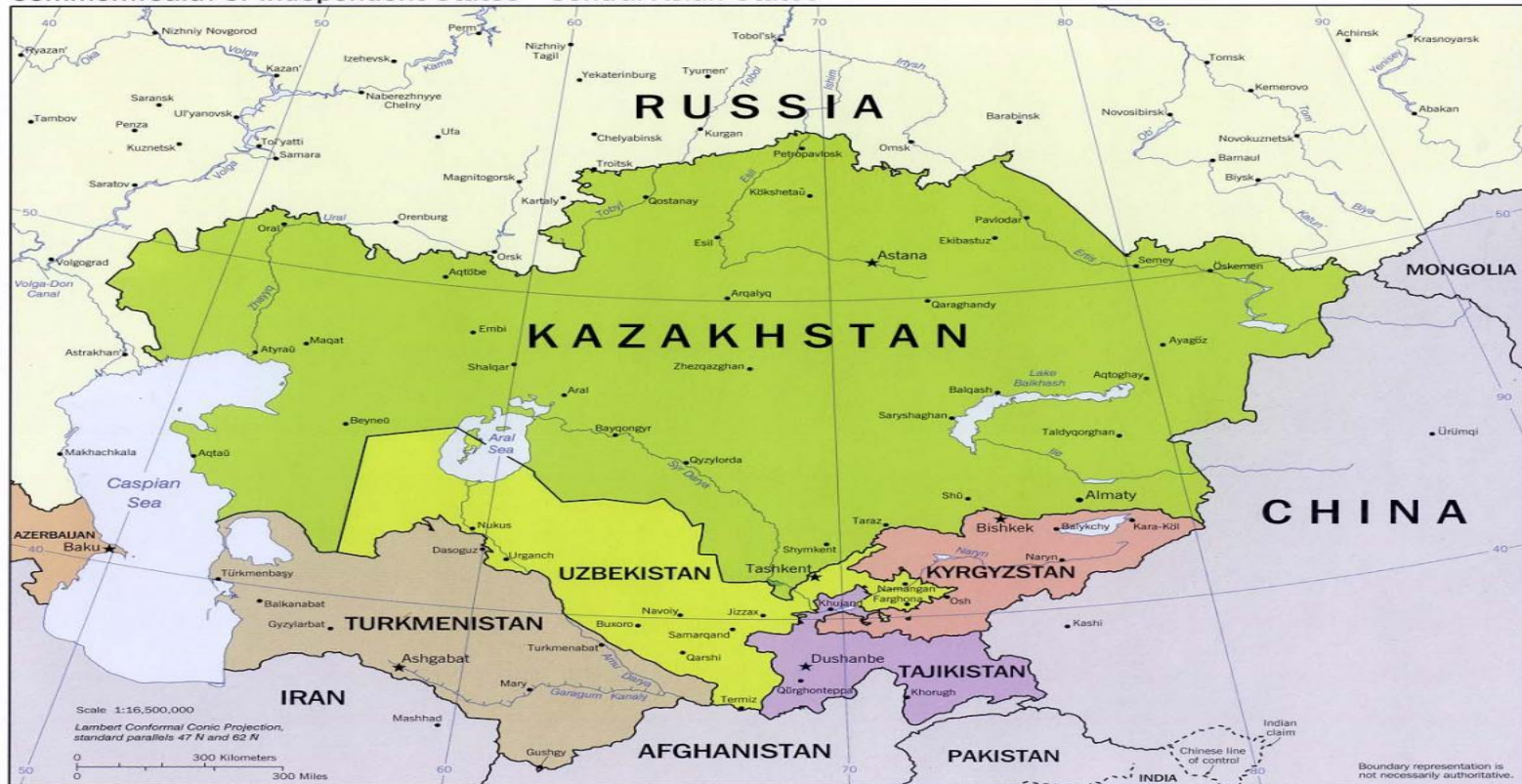
Commonwealth of Independent States - Central Asian States

It has borders with (clockwise from the north) Russia, China, Kyrgyzstan, Uzbekistan, and Turkmenistan, and also adjoins a large part of the Caspian Sea.