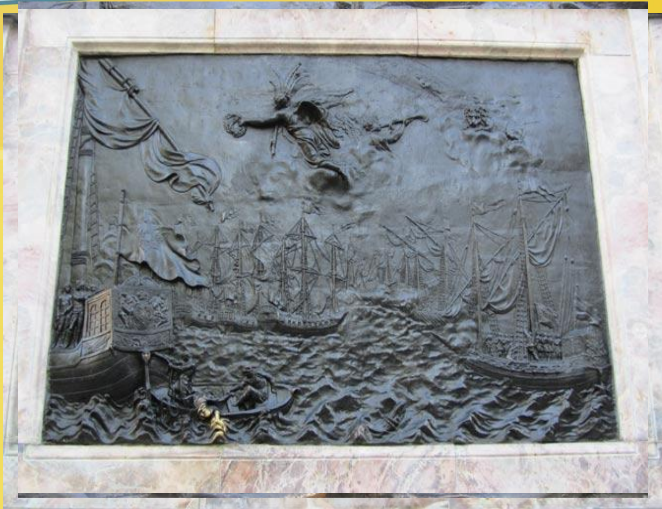
The Naval Fight of Gangut

The pedestal is decorated with bronze bas-reliefs depicting the main victories of Peter's time: "Poltava Battle" and "The Naval Fight of Gangut".