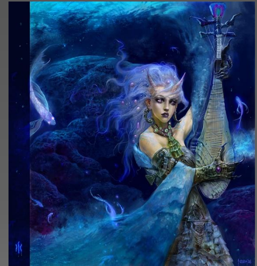
And his mother (the water-witch)