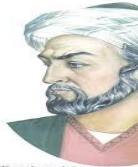
Абуали Сино - Авиценна